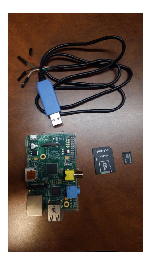
Figure 1: Pi 1 Hardware