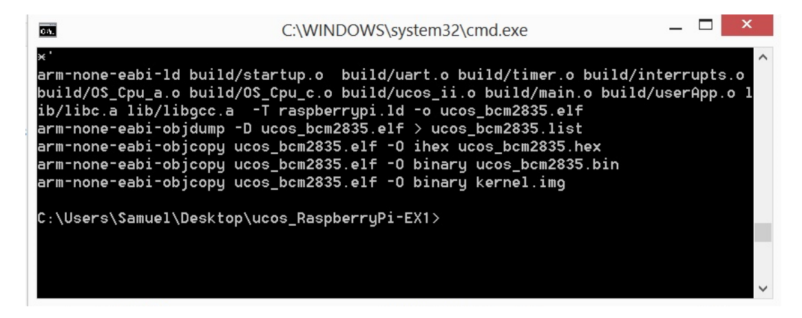
Figure 3: A successful build output

on a host PC to run the Putty [7] Serial application so we can see our tasks executing. Putty Configuration can be seen in Figure 2. Using a serial to GPIO cable attached to both the Pi and our host PC we need only to apply power to the Pi and let the program run. By observing the Putty terminal we will shortly see the application begin to populate the terminal window with a graphical output and run the loaded project. The build of the kernel can be seen in Figure 3, and the output of a running example can be seen in Figure 4.