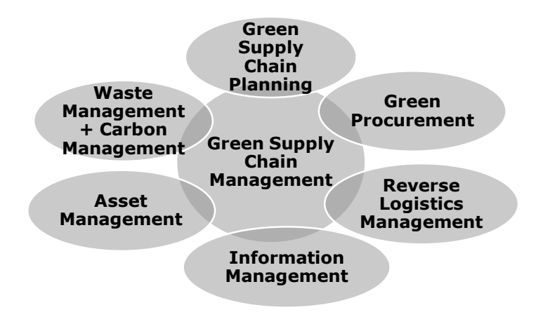
FIGURE 1: Components of Green Supply Chain Management

As shown in the above figure, GSCM comprises of green material management and planning, green procurement, green marketing, and reverse logistics. Gandhi et al. (2015) stated that competitive advantages of construction companies can be improved by implementing green practices. Similarly, it helps to minimise waste generation, maximise environmental performance, improve cost-effectiveness and improve organisational skills. Therefore, implementation of GSCM plays vital role in organisations at both environmental and organisational levels (Gandhi et al., 2015). As construction is a project based industry, special capabilities are required when implementing GSCM by considering design, procurement, manufacturing, engineering and logistics needs of construction projects.