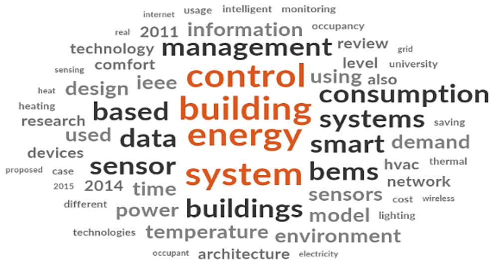
Figure 2. Word Cloud of the BEMS in Literature (Retrieved data from Nvivo)

temperature sensors may deteriorate and lose precision in their calibration or break or get broken; control dampers and valves may stop working correctly as they age or wear out. Thermal dead bands and solar cooling alternatives are the other two most frequent sources of issues (Harish & Kumar, 2016). The control software may also become outdated. Figure 2 has a word cloud generated from relevant papers, which presents the top 100 words constructed by collecting the different definitions available in the existing literature of 17 selected papers. It notes that the top words are “ Building ,” “ Energy ,” “ System ,” “ Control ,” and “ Management ,” among others, all representing that the technological and operational aspects of building management inspire the definition. Therefore, the data and building focus are the significant shortcomings of the current BEMS literature, indicating a need for more integrated approaches that include real-time data analysis, predictive maintenance, and enhanced system interoperability for more efficient and sustainable energy management.