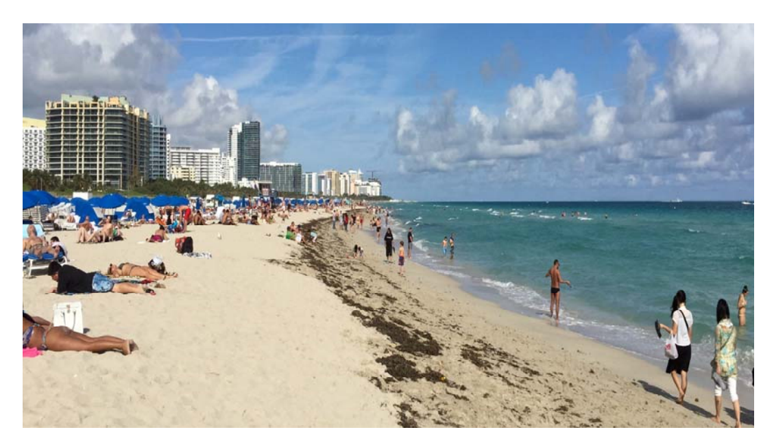
Figure 1: A typical beach holiday without swimming advisory

addition, bacterial levels in recreational beach waters generally vary in a wide range and they are commonly measured using the most probable number (MPN). Mathematically, MPN could be best described with probabilistic models like Bayesian models.