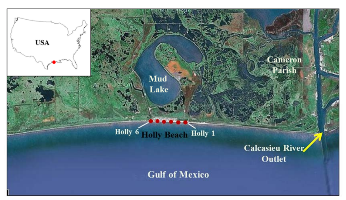
Figure 2: Location of study beach sites