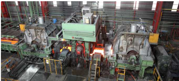
Fig. 2. Finishing stand of the Steckel mill 1780/quarto with furnace coilers.