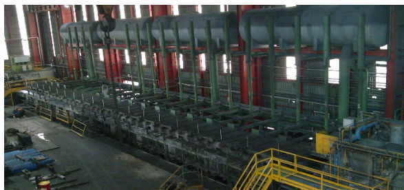
Fig. 3. Laminar cooling system.