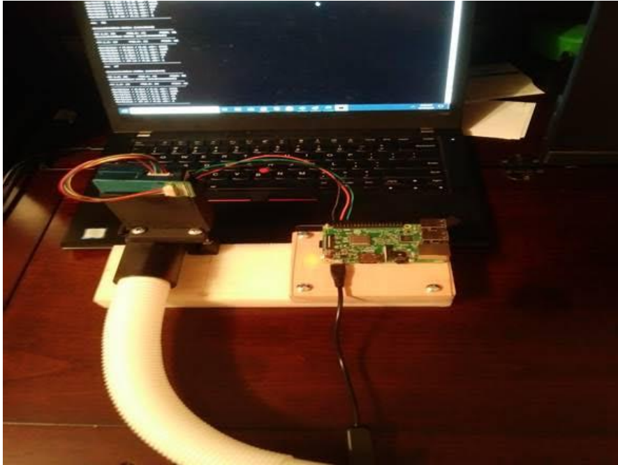
Figure 2 Coronavirus screening test device

The output from continuous particulate monitoring that covers exhaling event recognition is shown on Figure 3.