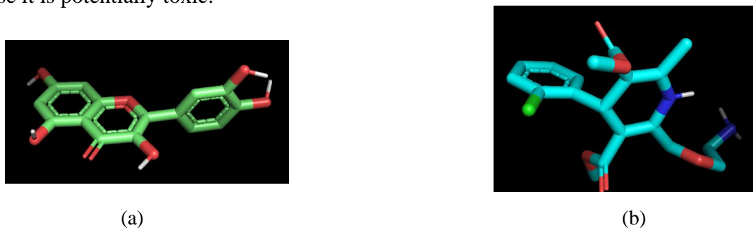
Figure 1. (a) 3D structure of quercetin compound, (b) 3D structure of amlodipine control compound

Toxicity tests have been carried out through ADMET predictions showing that quercetin compounds have no potential carcinogens or mutagens. The rate of absorption by the body was higher than with amlodipine as a control. However, it is not recommended to extract this compound because it is potentially toxic.