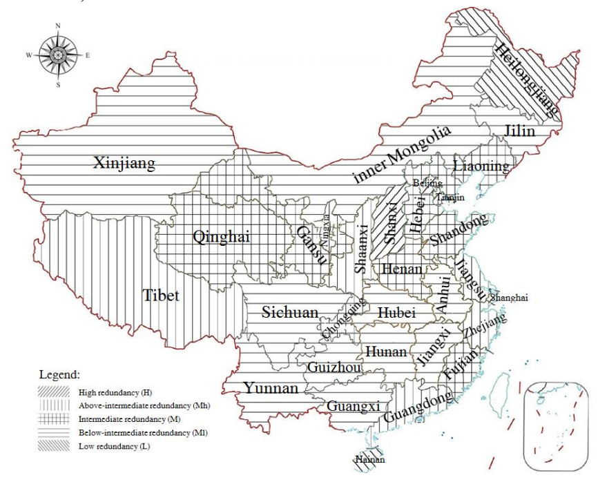
Figure 1. Provinces zoned according to the redundancy of rural labor force

force in a province. The closer the value is to 0, the lower the redundancy of rural labor force is, and vice versa.