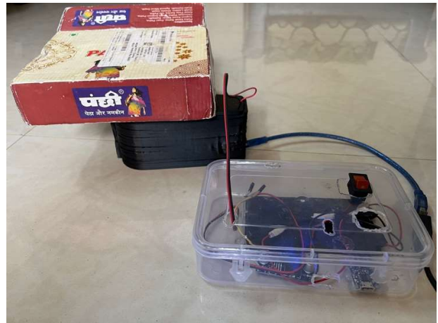
Fig 1.1 LIDAR covered with obstacle

In above fig 1.1 cardboard box is placed over LIDAR sensor, then after starting the sensor it plots the points using data given by time-of-flight sensor on processing software.