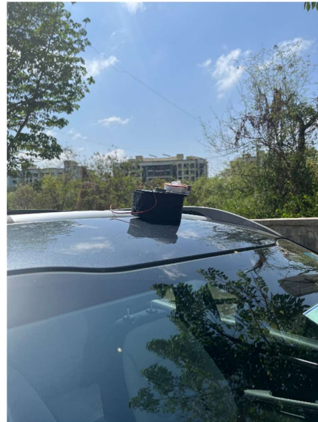
Fig 1.4 LIDAR Sensor attached on a Real Car (Close View)

is attached on a real car. By scanning the laser pulses in different directions and combining the distance measurements, the LIDAR sensor can create a detailed 3D map of the environment around the car. This map can be used by autonomous vehicles to detect and avoid obstacles, navigate through complex environments, and make decisions about how to drive.