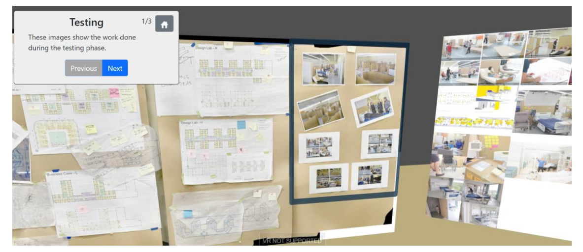
Figure 1: Artifacts on the wall including videos, photos and documents.

the new Waipapa' ward at Christchurch Hospital. The videos were all filmed in an interview style, where lecturers in the course interviewed CDHB employees while they explored the artifacts and discussed the innovation process used at the design. The videos were filmed using 360° cameras. The artifacts (Figure 1) were photographed using a standard camera and then the photos were processed using stereo-from-motion photogrammetry software (Agisoft Metashape) to create digital doubles. On top of these resources, additional video and photography from the ward design process were also used in the virtual lab, e.g. one of the course lecturers went to film a walk-through in the completed ward using a 360° camera. This virtual lab called 'Virtual Ward Design' was created to preserve the educational benefits of a field visit to the CDHB 'Design Lab'.