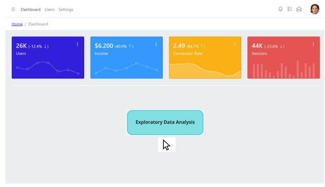
Figure 3: Select the Functionality

Such a portal will prove to be handy for the frequent coders who don't want to code every single time the same steps and also it's going to save a lot of time in the development of bigger projects.