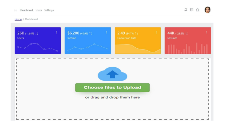
Figure 2: Upload the Database

Here, this portal is proposed, which can conduct all these steps of data preprocessing without using a single line code. A user of the portal has to just upload the data set and get his job done by just a few clicks.