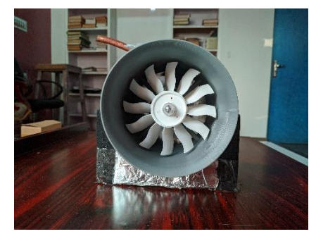
Fig 2: Front View