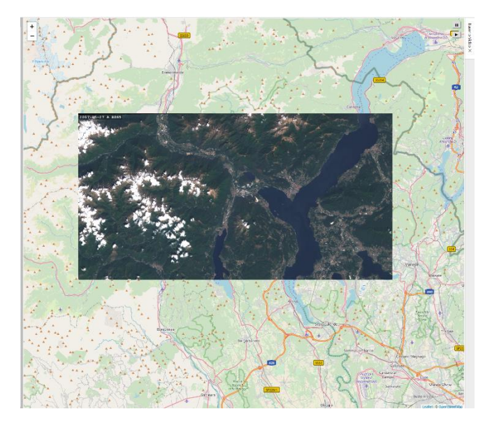
Fig. 6 : Video overlay of a georeferenced temporal video showing one after the other all the Sentinel-2 images acquired in time over the area.

Recent versions of ipyleaflet allow for the overlay of videos on top of the map. We are using this new function to create georeferenced videos starting from the multi-temporal Sentinel-2 products acquired over the same area. The videos can be "played" directly over the map (even while zooming and panning) and give an interesting insight on the evolution of the land over time with possible application in agriculture (like the evaluation of harvesting times) or in forest monitoring (e.g. control illegal deforestation).