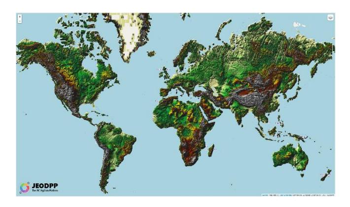
Fig. 1 : ALOS Global Digital Surface Model "ALOS World 3D - 30m (AW3D30)" displayed inside JEODPP as a colored hill-shading [].

dataset regarding land use and land cover at European level (Corine Land Cover [] and Urban Atlas []). The process of acquisition of new datasets is continuous and has recently led to the availability, as an example, of a new global DEM at a resolution of 30 meters produced by the Japan Aerospace Exploration Agency (JAXA) and called "ALOS World 3D AW3D30" []. As in the case of the other DEMs, the deferred mode processing functions of the JEODPP APIs allow to obtain high-impact visualizations such as that presented in figure 1 and displaying the coloured hill-shading with a custom colour scheme.