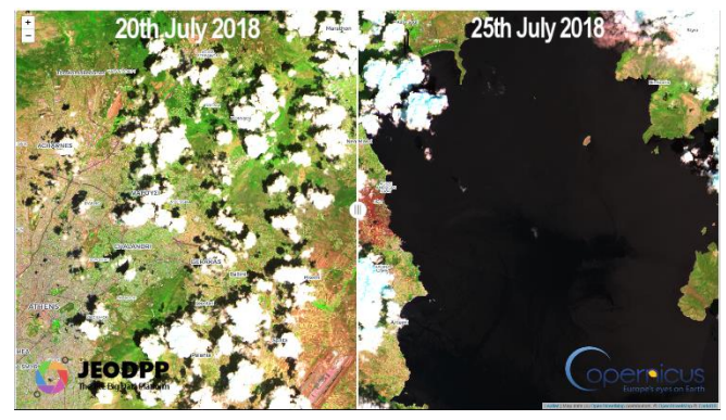
Fig. 5 : Temporal comparison of two SWIR RGB compositions, from Sentinel-2 images acquired before and after the Mati fires in Greece.

One of the mostly appreciated functions recently added to the interactive visualization component of JEODPP is the ability to easily compare two different datasets. It can be used for comparison of completing different datasets (like a DEM and a EO image, or a basemap and a vector dataset, etc.) or on comparison of two acquisition dates of the same product. It is based on a new function available on ipyleaflet: the split map control . When activated, the tool displays a vertical line at the center of the map and the two datasets on each side of the line. The user can move the line horizontally to quickly compare the left and right map on the same piece of land.