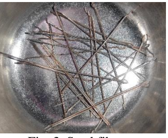
Fig. 3. Steel fiber