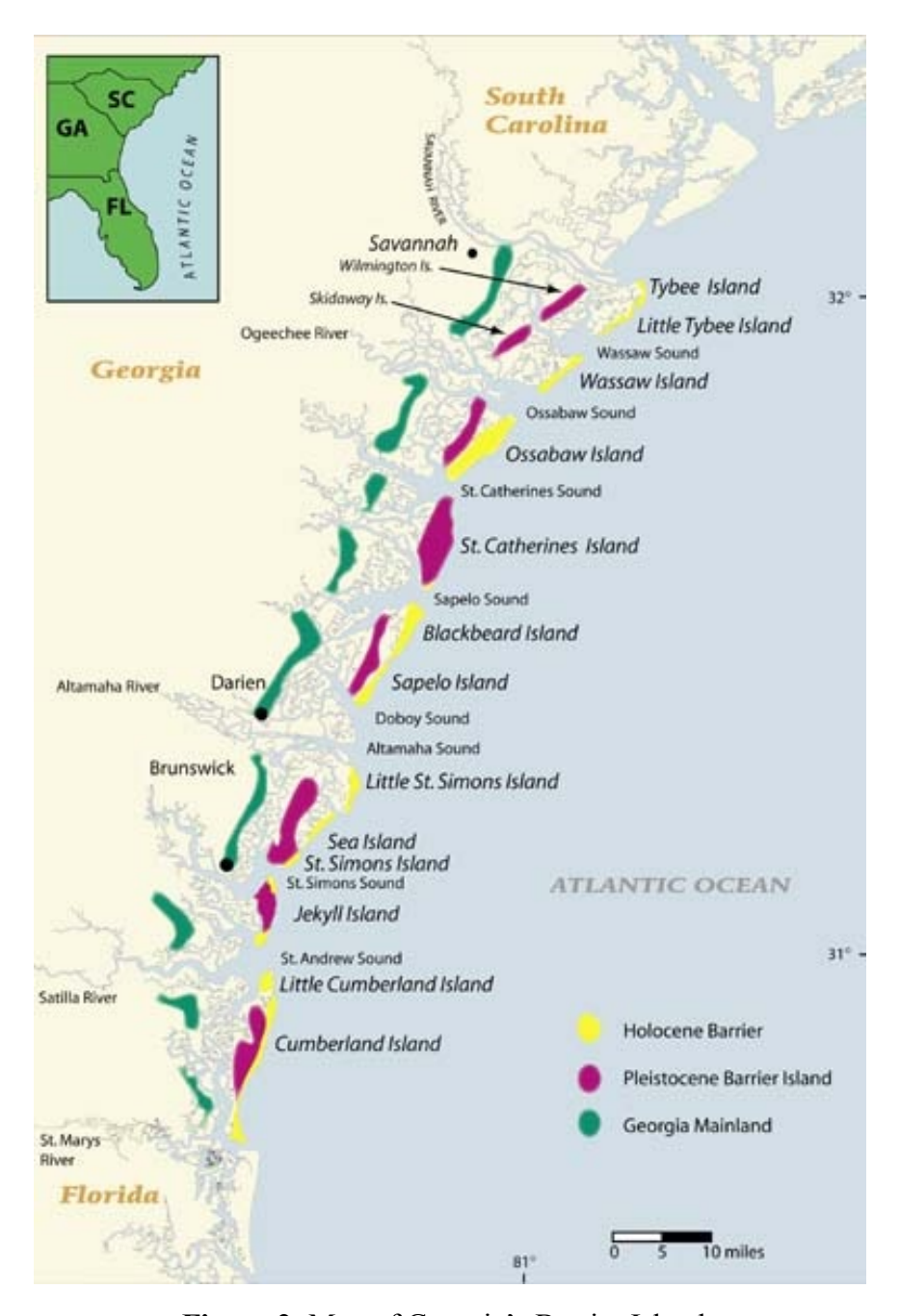
Figure 2: Map of Georgia's Barrier Islands

environmental managers and researchers in Georgia, particularly in the Georgia Department of Natural Resources (GDNR).