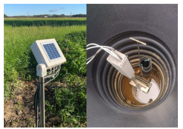
Fig 2. Prototype of controlled well installed to test area.

The control well hardware has been tested at various field sites around Kannus, Nivala, and Ruukki during the fall and summer of 2021 and 2022. The main challenges were in optimizing energy use and maintaining reliable communications. Some issues were found regarding the quality of components, especially the cellular radio modules which were found to be somewhat unreliable and inefficient. The tests, however, proved the concept feasible and means of improving reliability and energy use were identified and partially implemented for ongoing tests through 2023. The results indicate that further hardware and software revision will make autonomous all-year-round operation possible regardless of the lack of sunlight during December and January.