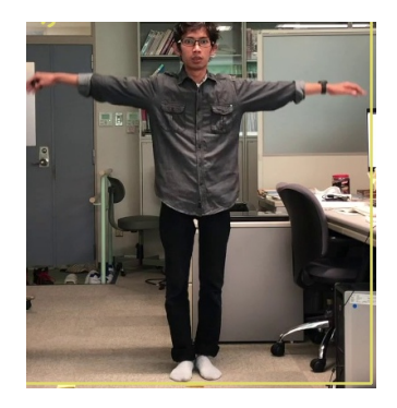
Fig. 3: YOLOv3 frame cropping result

point [x,y]. However, the pose estimation that has given by the OpenPose is not always as reliable as expected. Fig. 2 shows the mistake to estimate the left wrist position. The problem of this estimation mistake should be solved since it will become interference for the sequence data prediction. In case of that, we will not get the prediction correctly. Therefore, we need to limit the window frame of the human feature before processing it on OpenPose. We use YOLOv3 to restrict the window size of the frame. YOLO is a single neural network that predicts bounding boxes and predicted class probabilities directly from full image, and in one evaluation [12]. Since this whole detection pipeline consists of a single network, it can be optimized end-to-end directly on detection performance [12]. As shown in Fig. 3, the frame of human feature will be the only input through OpenPose, then the result from OpenPose will be set back to the original frame image. Now, we have obtained the coordinate data of human body pose without any long estimation error.