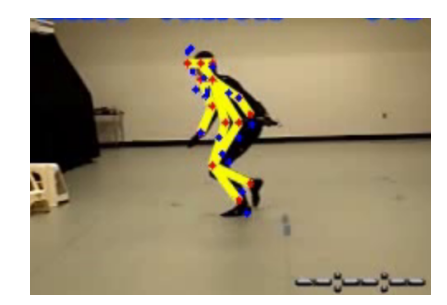
(b) RNN-LSTM Prediction