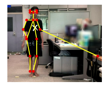
Fig. 2: Frame with human body part miscalculation.

Before we proceed to obtain the prediction, we need to convert the coordinate data into the movement data which contains distance and direction. These movement data obtained from the change of the coordinate from the frame F_i to the frame F_{i-30} with Euclidean formula. After the movement data has been obtained, we proceed to the processing method that includes RNN-LSTM for the prediction.