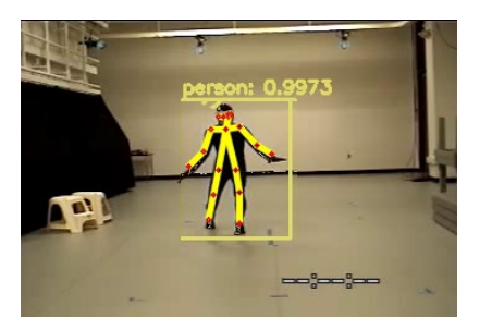
(a) Feature extraction by YOLOv3 and OpenPose.

The result of the extracted feature in Fig. 4a and Fig. 5a give us the 18 nodes of human body pose estimation. Even though, because of the eyes and ears as the human body parts practically will not move from the head we decided to conclude the node of ears, eyes, and nose as a head node that will be centered to nose node. YOLOv3 works well to prevent distant pose miscalculation. Prediction result on our dataset is shown in Fig. 4b, where the red points are the current position, and the blue points are the prediction position. As well as the prediction result on CMU dataset in Fig. 5b. Table 1 shows the evaluation distances for each node defines the frequency of the value below 1.8% of of the the diagonal frame pixels away from the ground truth in percentage. Generally, the prediction results on our dataset shows the better results than the prediction results on CMU dataset where the right knee and left knee have been obtained 95% of the prediction results are reliable. Altough, elbow and wrist nodes on our dataset show that RNN-LSTM has difficulty on predicting the sequence data since elbow and wrist on our dataset move more than other nodes in the video. Whereas the prediction results on CMU dataset mostly below 60% of the prediction result that are reliable. Even though, the prediction results on left hip, left knee, and left ankle show more reliable results than the rest of the nodes which show 72%for the left hip, 82% for the left knee, and 83% for the left ankle.