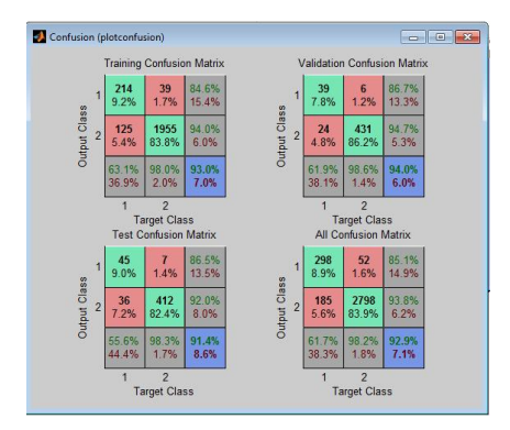
Fig. 3. The Result of Confusion matrix as neural network output

At this step of the proposed combined algorithm, customer churn prediction is performed due to neural network output. The Knowledge that is produced must be analyzed at the evaluation step to determine its value. In this regard, the Confusion Matrix is one of the methods to evaluate classification systems performance [20]. This matrix is used to show the percentage of correct and incorrect classification.