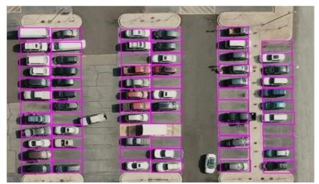
This will identify each parking place for detection.